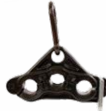
Part No. 9888 Stk. Code 47261